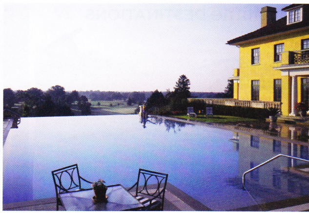
Clockwise from top Left: Table of Viogniers from Chrysalis Vineyards, the horizon pool at Keswick Hall's Courtyard Vineyard, Trump Winery and King Family Vineyards. Opposite Page: Chatham Vineyards.

in February 2012, allows guests to peruse the wine list, clicking on individual wines to learn more about them. Users can also search for wines by category, varietal, region and more.