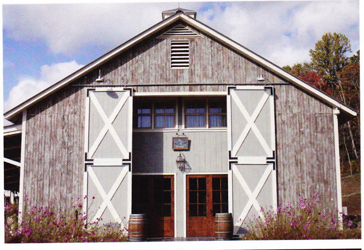
Left: Little Washington Winery. Right: Pippin Hill Farm & Winery.

sensational spirits? Check out the apolo matches at King Family Vineyards (Gold medal winner for their 2008 Meritage Blend at the 2012 Governor's Cup), which are held each Sunday at 1:30 p.m. from Memorial Day weekend through mid-October. Matches are free and open to the public. Food (local cheese, meats, olives, bread and hummus) and wine is available in the Tasting Room, but visitors are welcome to bring a picnic lunch along with them and park tailgate-style around the