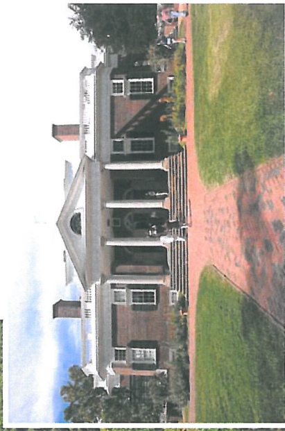
Left: The Barboursville vineyards in the foreground of the Blue Ridge Mountains. Inset: Thomas Jefferson's house at Monticello where he planned to grow vitis vinifera grapes