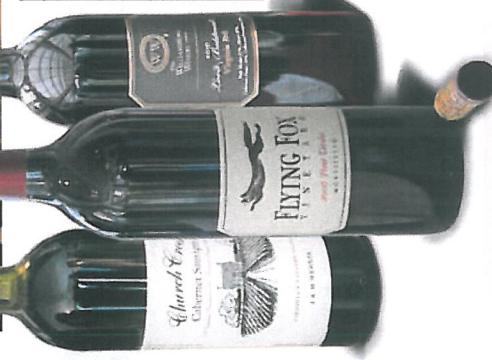
Above: Barboursville cellar with its acclaimed Octagon wine ageing in barrels. Left: Wine from Church Creek, Flying Fox and Williamsburg wineries